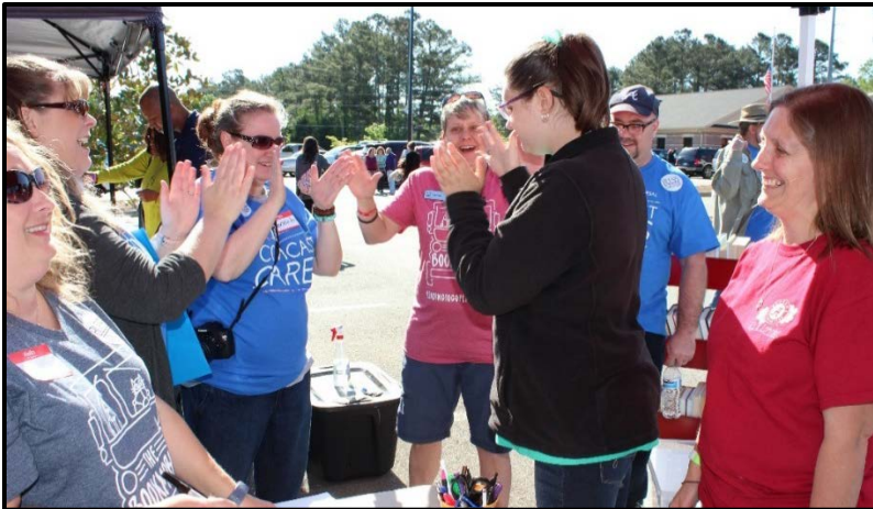
Above: Volunteers play a four-sided game of patty-cake with a Bookmobile visitor while her mother looks on at BLESS weekend on April 27 th . We always have a good time!

Serve Saturday at the Allatoona Resource Center, Saturday, June 15, 10 a.m. – 1 p.m.