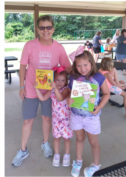
Above-left: SPARK Community Center; Above: Cartersville Gardens apartments; Above-right: Veteran's Memorial Park, Adairsville; Right: Douglas St. UMC