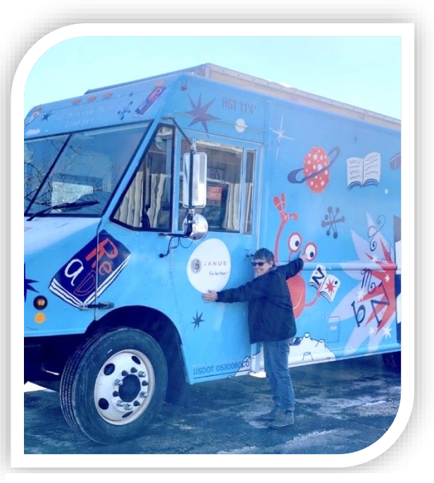
She's ours! Picking her up in Littleton, CO.

Day 6: Huntsville, Alabama → Cartersville, Georgia