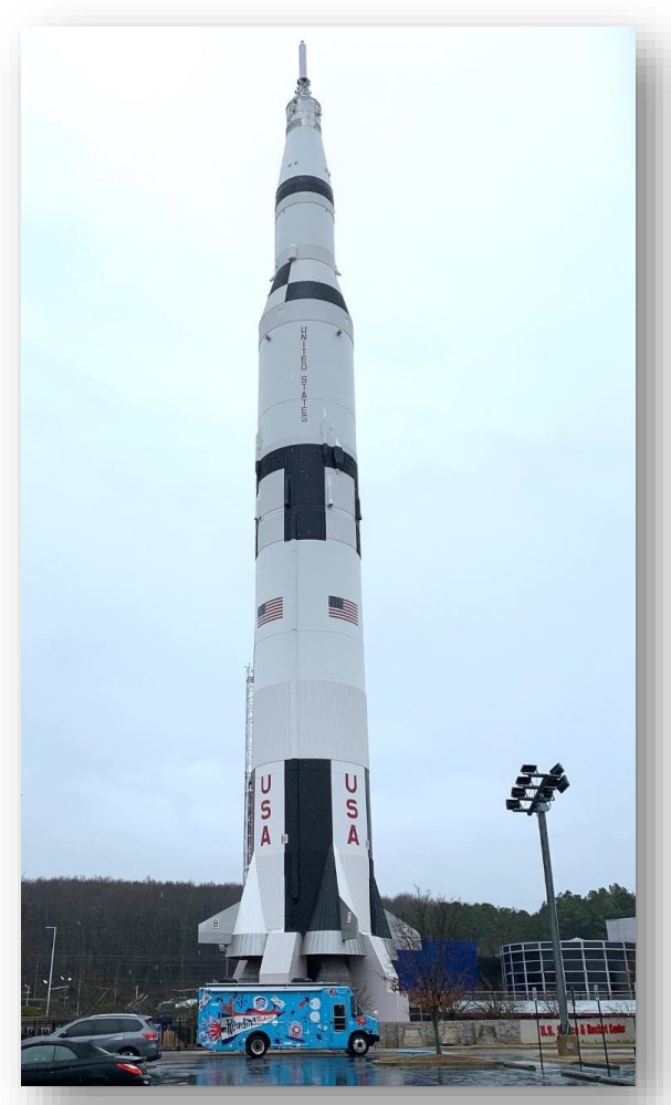
The Reading Rocket visits the U.S. Space and Rocket Center in Huntsville, AL