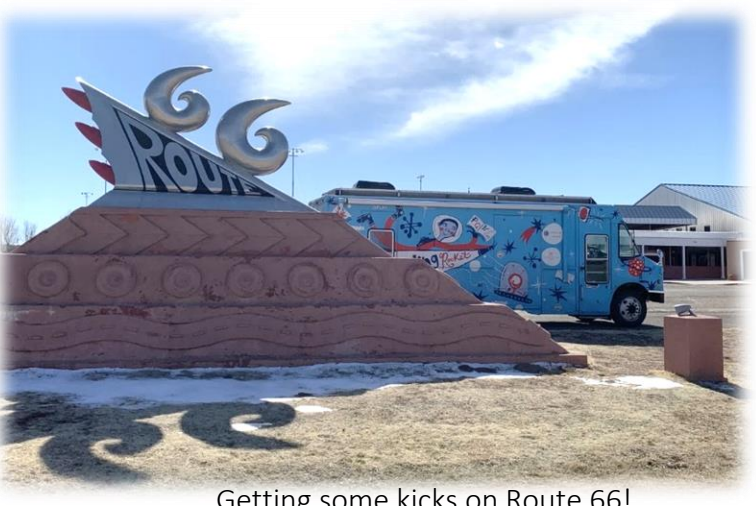
Getting some kicks on Route 66!