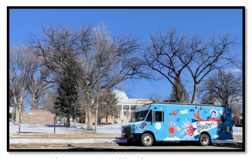
Outside a Carnegie Public Library in Las Vegas, NM