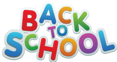
Below: The Bookmobile gave away 133 books at the Omega United Church back-to-school event in Adairsville on Saturday, July 18.

Summer totals: 3,297 books given away April – August 2020