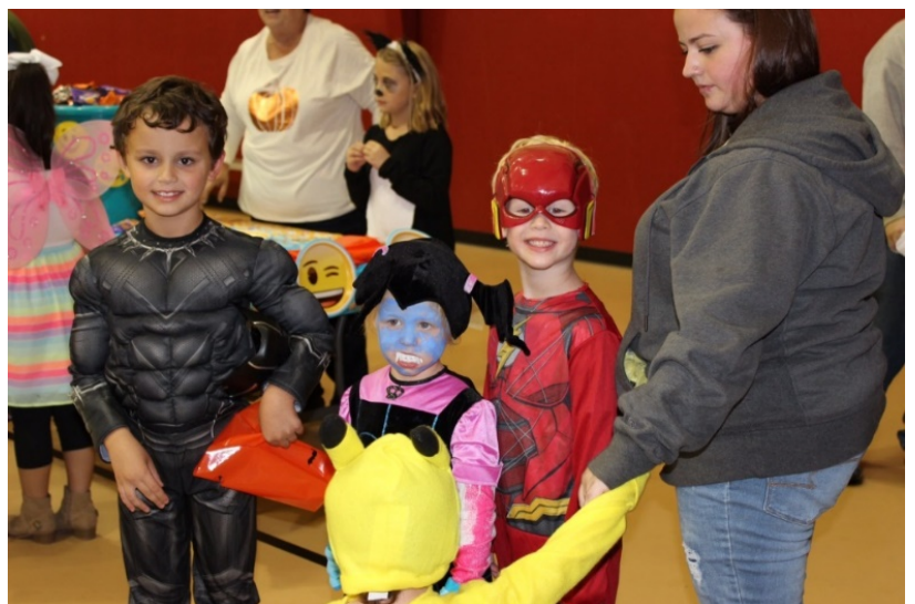
Above: Trunk or Treaters at the Allatoona Community Trunk or Treat, October 26, 2018