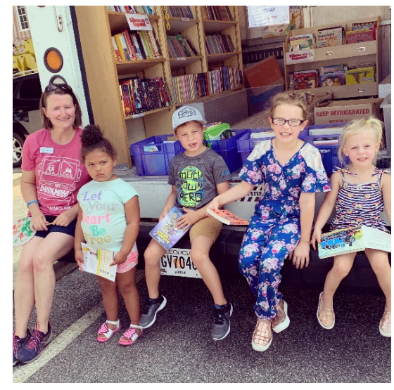
Photo: the Bookmobile at the Cartersville Farmer's Market July 6<sup>th</sup>. 73 books given away.

Want to see your name and logo featured on the Bookmobile vehicle, our newsletters, and website? Contact us at readingtogoplaces@gmail.com to receive a Sponsorship Information Packet and learn about the benefits of partnering.