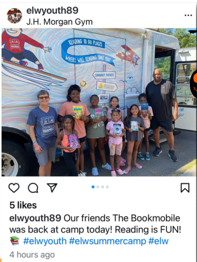
5 likes elwyouth89 Our friends The Bookmobile was back at camp today! Reading is FUN! #elwyouth #elwsummercamp #elw 4 hours ago